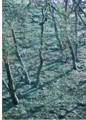
Contours to the surface to ensure intimate soil contact