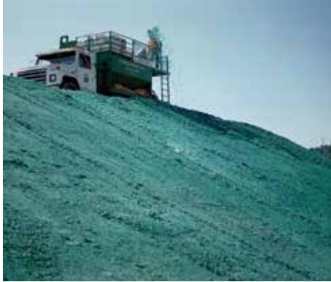
Forms an erosion-resistant, built-in-place blanket that prevents polymer leaching and dispersion of soil particles