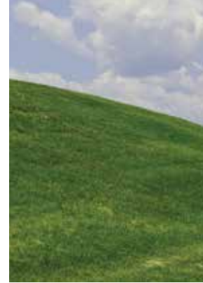
Non-toxic, environmentally safe and biodegradable