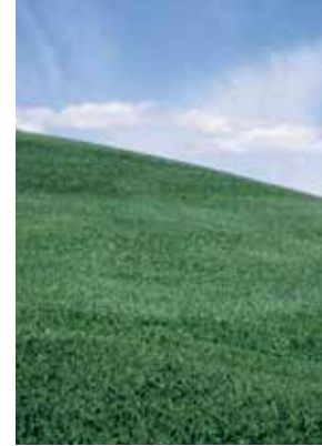
Best slope protection at the lowest overall cost