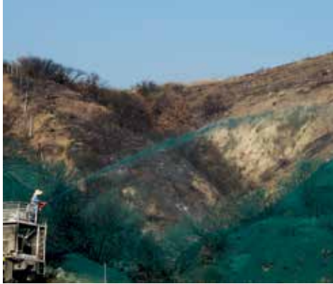
Greater coverage than other BFM's for more cost-efficient application