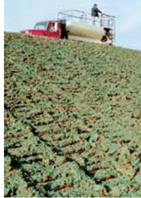
Contours with the surface to maintain intimate soil contact