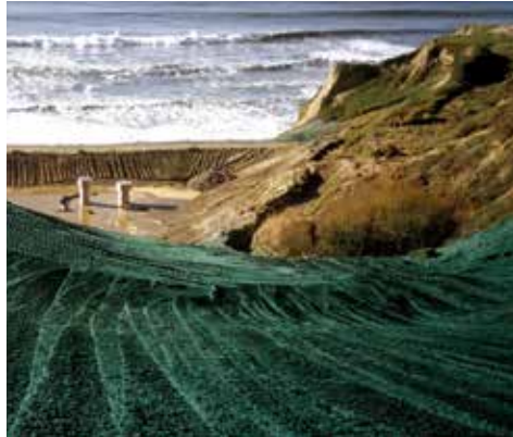
Less expensive than extended term blankets, and less soil preparation is required